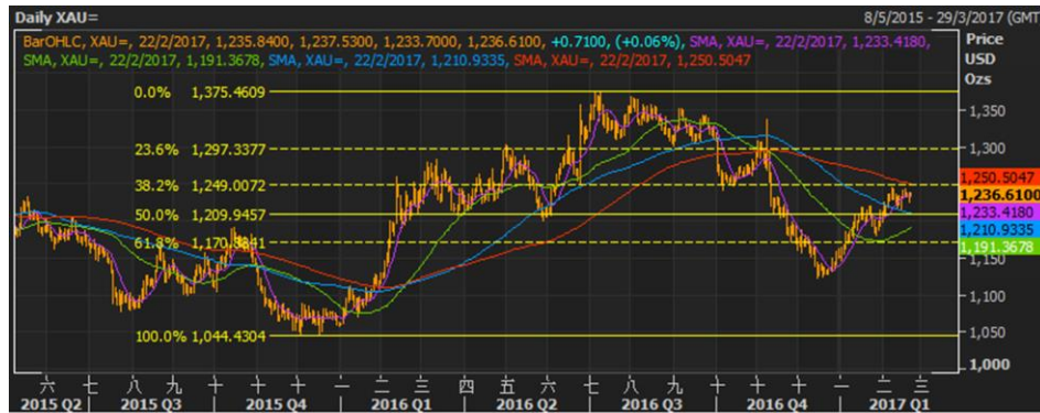
Gold spot daily chart

Market is looking ahead to Wednesday's FOMC minutes of its February meeting. Commodities prices will face stronger pressure if the likelihood of a March rate hike is higher. The yellow metal is likely to stay in range between $1225 and $1250 for now.